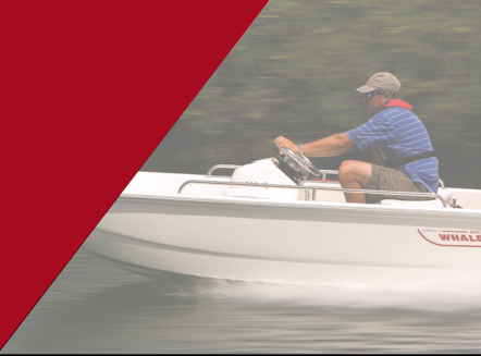
110 Sport Engine Comparison Graph